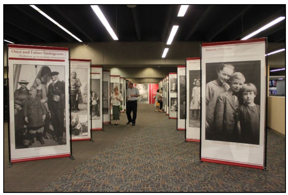
Twenty double-sided panels create a virtual walk into the world of Danish immigrant children at the turn of the 20th century.

Renze Display of Omaha, the company who actually printed the four foot wide by eight foot tall panels, set up the display on September 9. Archive volunteers completed the exhibit with several artifacts that enhanced the photos and told a story of their own. Among these artifacts were a beautiful baptismal gown and certificate loaned by Phil and Florence Larsen of Blair. In addition Phil and Florence loaned a globe, toys and other artifacts dating from the early 1900s. Archive board member Chris Gehringer of Omaha, whose mother stars in the marquee photo used in all print advertising, posters and the cover of the informational booklet, loaned a wonderful handmade child's dresser with